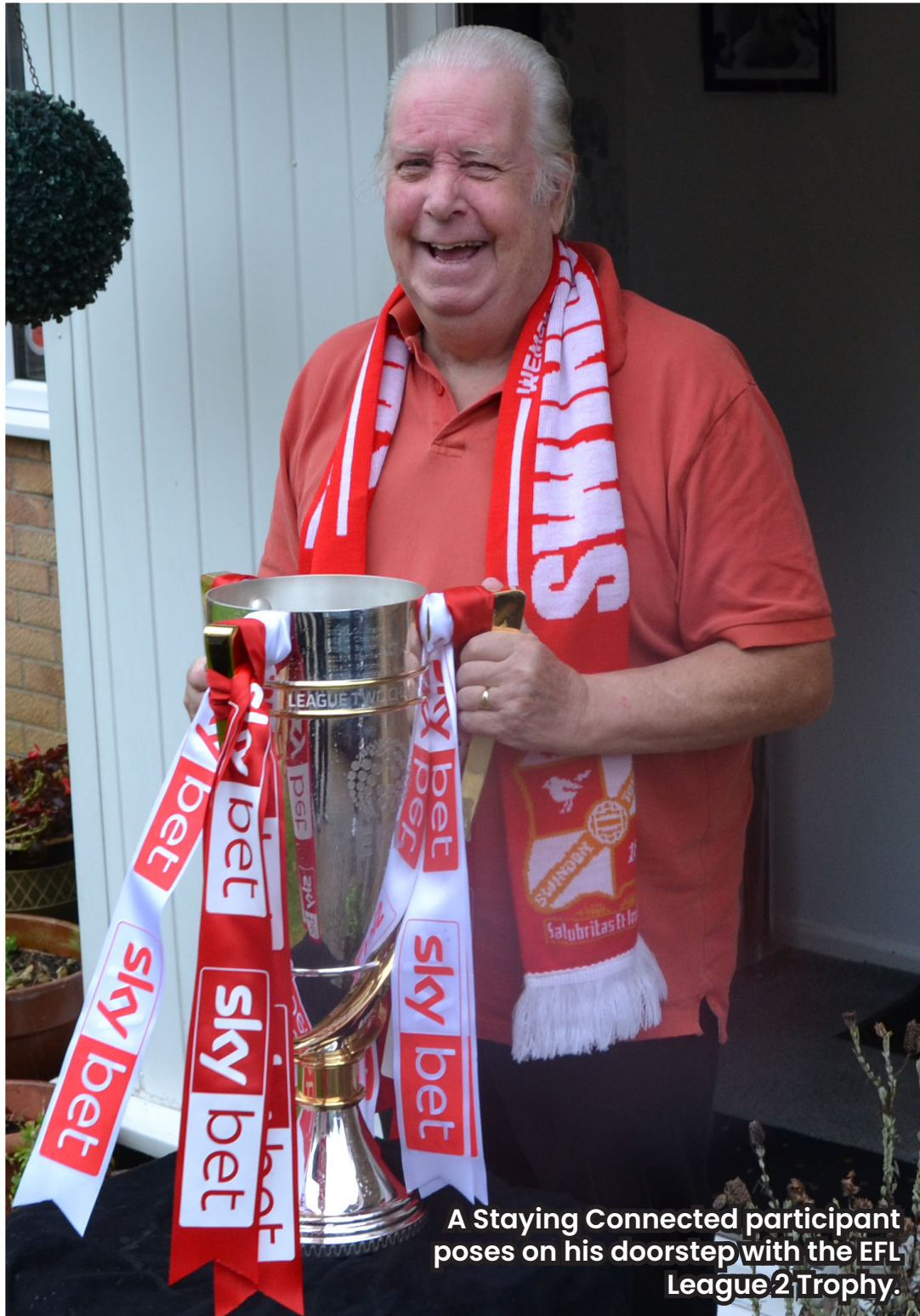
A Staying Connected participant poses on his doorstep with the EFL League 2 Trophy.