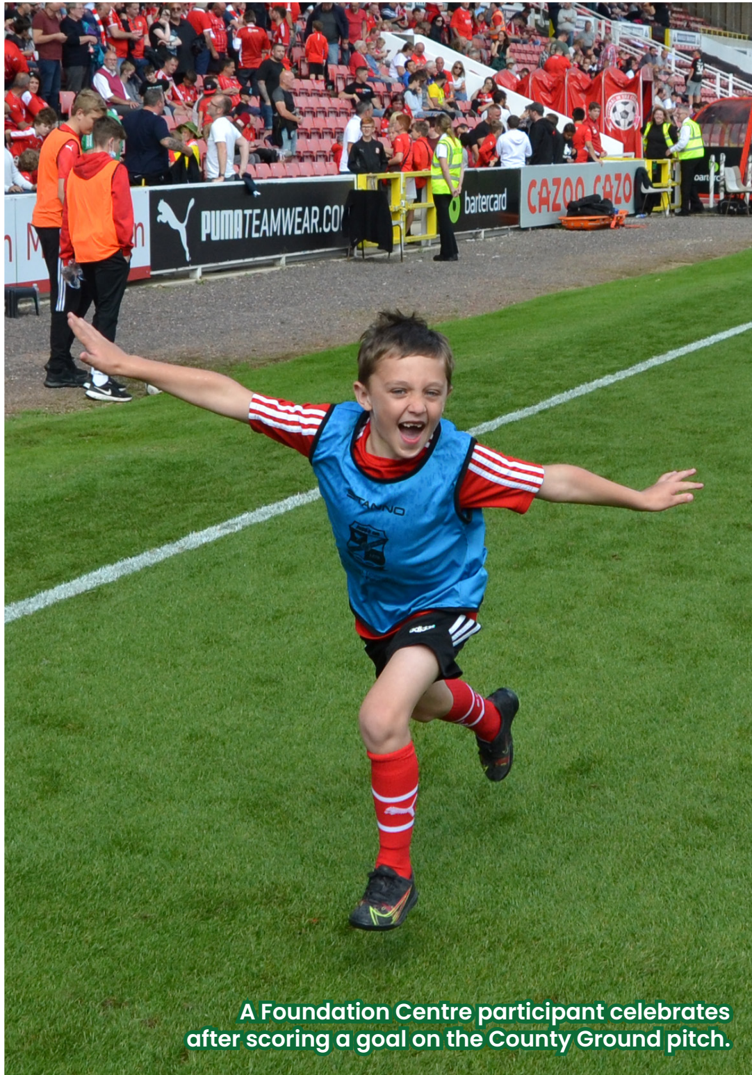
A Foundation Centre participant celebrates after scoring a goal on the County Ground pitch.